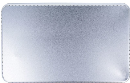
3. TOP BOX (PD)